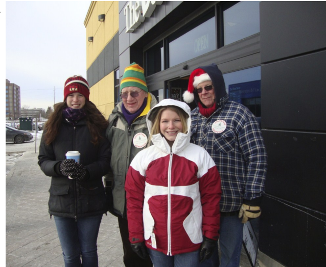
Volunteers brave the cold to collect bottles during the 26th Annual Running on Empties event. (December 2013)

The 13<sup>th</sup> Annual Ottawa's Biggest Bake Sale was held on October 11th at Billings Bridge Centre with TD as our title sponsor once again. The event had 10 community groups participating with the sale of their own baked goods and 21 local bakeries donating baked goods for the Caring and Sharing Exchange to sell. The Bake Sale was an overall success raising over $8,300 for the Christmas Exchange program. This included sales of raffle tickets