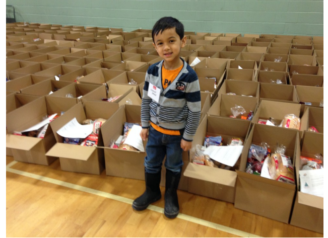
A young volunteer stands in front of hundreds of hampers that were packed and delivered on a single day by dedicated volunteers and sponsors.

Although we were unable to provide support for all of the 19,627 individuals who requested assistance through the 2013 Christmas Exchange program, this was still a year to be proud of! With the help of our donors, we provided 16,725 individuals in need with Christmas assistance, which is an increase of 60% over 2012's total of 10,502! We can only hope that next year, there will not be anyone left on the waiting list.